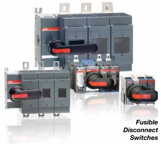
Fusible Disconnect Switches