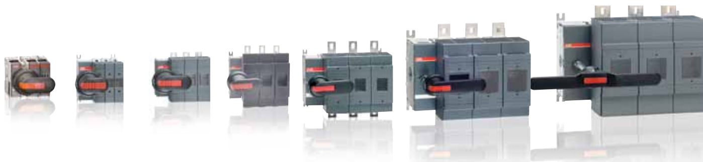
OS30FA_12 OS60GJ03 OS100GJ03 OS200J03 OS400J03 OS600J03 / OS800L03 OS1200L03