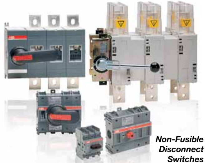
Non-Fusible Disconnect Switches

Positive opening operation safeguards users in case of welded contacts due to an extreme overcurrent situation. The ABB switch design cannot reach the OFF position unless the contacts are truly open. This safeguards the user by alerting them of the problem, maintains door interlock safety and does not allow a padlock to be inserted.