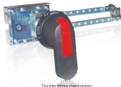
Double throw mechanism