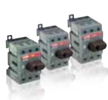
OT16F3 OT25F3 OT40F3