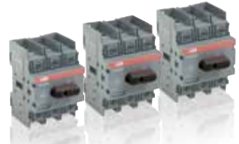
OT30F3 OT60F3 OT100F3